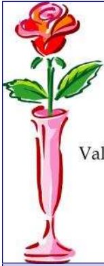
Youth Valentine Dinner

The Youth are planning a special dinner at 6:00 PM on Saturday, February 9, in Wattenbarger Hall to celebrate Valentine's Day. The menu includes a choice of Breaded Ranch Chicken or Pork Loin with potatoes, green beans, salad, rolls, dessert and drinks. You get all this plus entertainment for $10/person. Tickets are available from any youth or you can call the church office at 745-1560 to make a reservation. A nursery will be provided. If you are unable to make an advance reservation, you are still welcome to come. Advance reservations help them plan better for the meal. Please plan to support our Youth. They work very hard to earn money for all their projects.