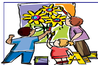
THANK YOU TO OUR SUNDAY SCHOOL TEACHERS